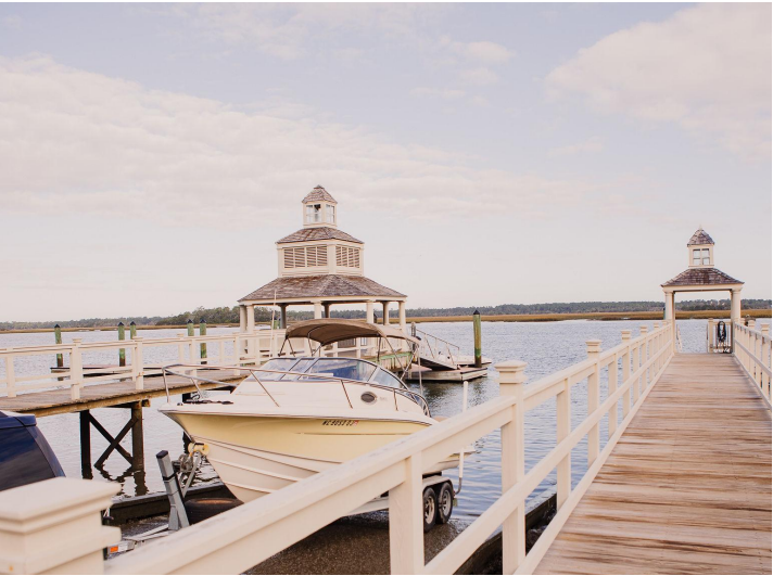
Rhett’s Bluff Boat Launch 102 RHETT’S BLUFF ROAD