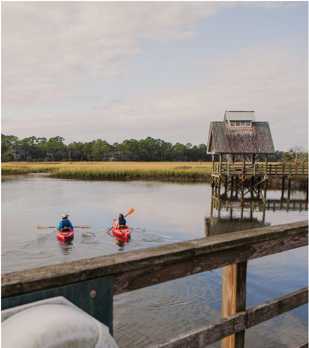
Cinder Creek Pavilion & Paddlesports Launch 36 BLUE HERON POND ROAD